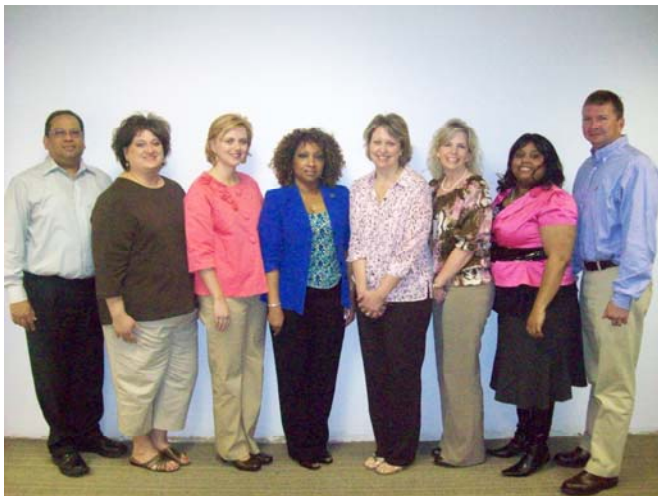
State Office Staff

In 1994, RSM joined with the Georgia Partnership for Caring Foundation, Inc. (GPCF), to address the needs of those persons who are ineligible for Medicaid or other state coverage programs. GPCF is a private, non-profit organization that provides limited voluntary services of physicians, hospitals, pharmacists and other health provider agencies.